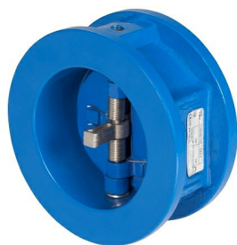
Fig. 2237 Wafer type check valve

Econ® "duo check" valves with steel (or ductile cast iron for >DN250) discs, NBR seal, pressure rating PN 16, suitable for fitting between flanges rated DIN PN 10/16, short Face To Face, low weight and easy to install.