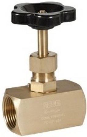
Fig. 718 Needle valve

Econ® needle valves, especially suitable for accurate regulation of gases and liquids. Not suitable for steam.