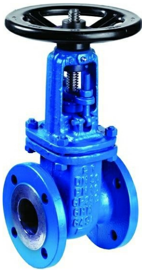
Fig. 309 Gate valve

Cast steel Econ® gate valves with stainless steel seat, pressure rating PN 16, flanged ends acc. to PN 16, bolted bonnet with yoke, outside screwed stem and yoke, rising stem, non-rising handwheel, flexible wedge, Face To Face acc. to EN 558, Series 14.