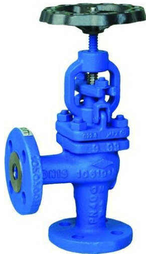
Fig. 418 Globe valve