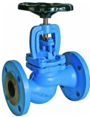
Fig. 241 ® Globe valve