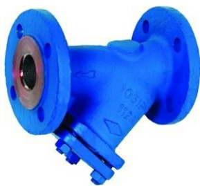
Fig. 1124 Y filter